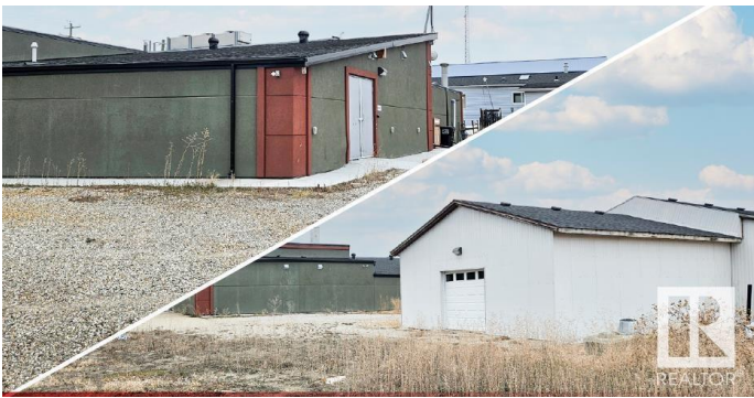
MAIN BUILDING PLAN