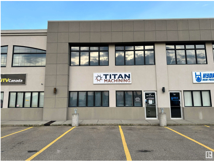
108-6051 47 St, Leduc, AB

Main Floor Exterior Area 2882.10 sq ft Interior Area 2735.89 sq ft